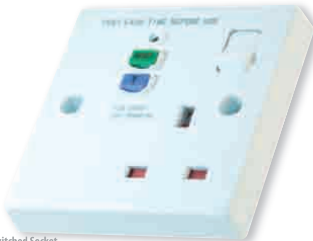
SP-RCD1GS RCD Protected Single Switched Socket