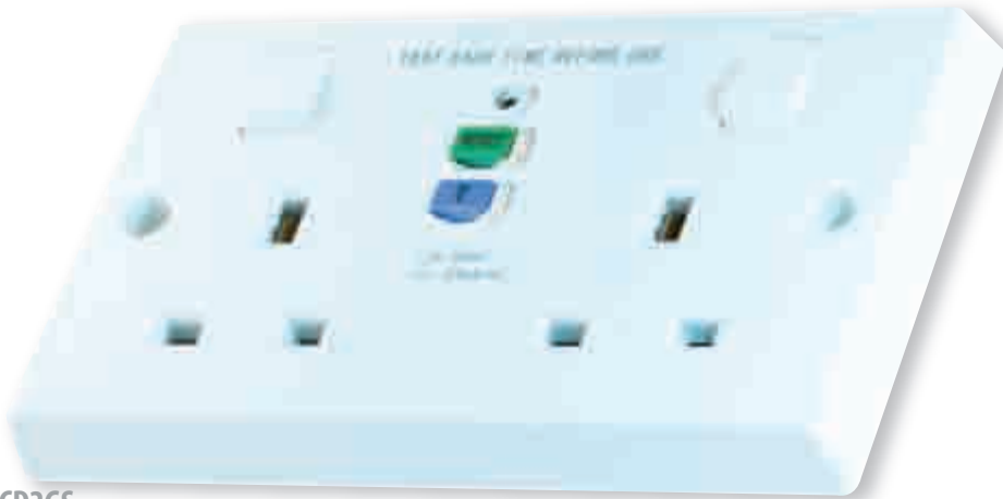
SP-RCD2GS RCD Protected Twin Switched Socket