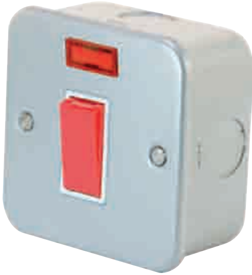
LG951NMB 1 gang plate with neon