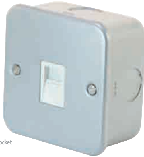
LG1514MB 1 gang master telephone socket