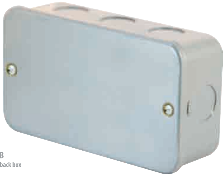
LG9112MB 2 gang with back box