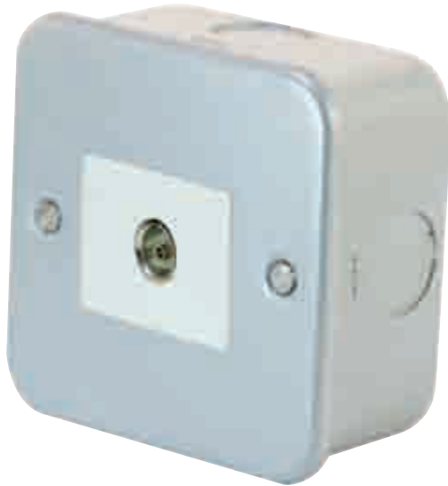
LG2162MB 1 gang TV socket