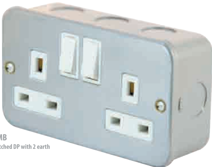
LG9096MB 2 gang switched DP with 2 earth Terminals