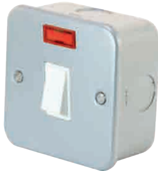
LG220NMB DP Switch neon