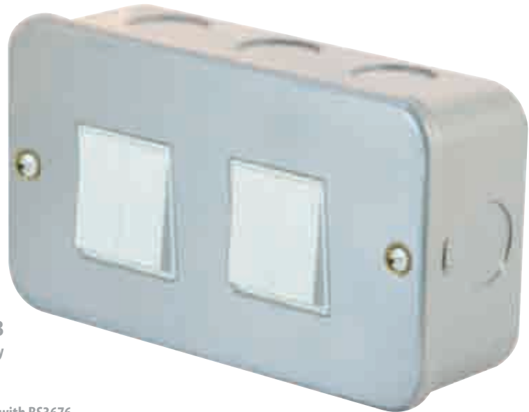
LG204MB 4 gang 2 way